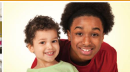
Early Education Services