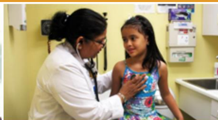
Your Medical Home