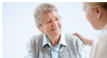
Meet Our Providers