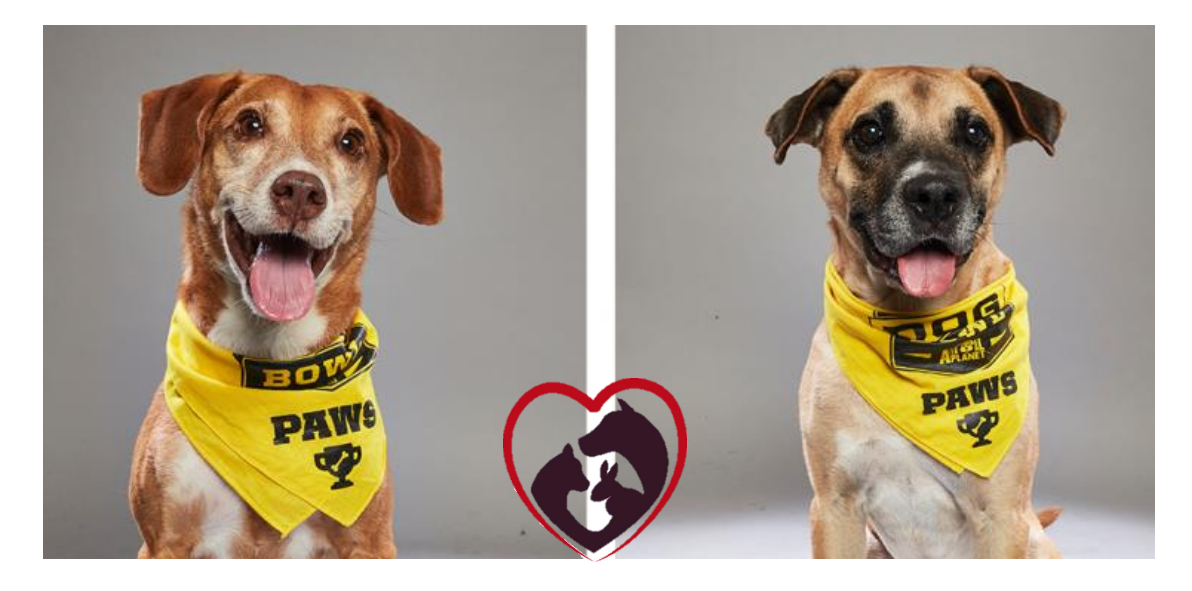
Dog Bowl stars Dino (left) and Gus, both 6, were adopted from the ASPCA Adoption Center.