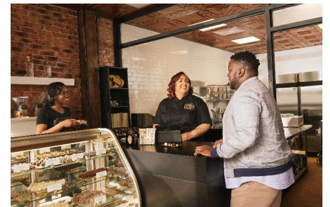
Photography: business owners compensated for their participation.